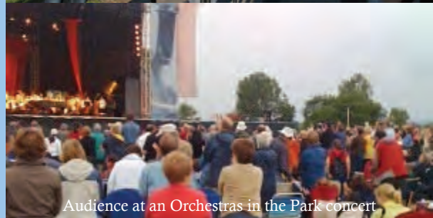
Audience at an Orchestras in the Park concert