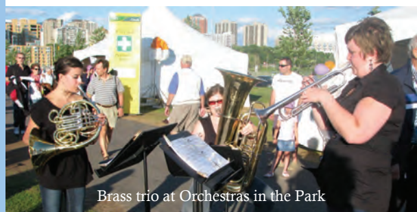
Brass trio at Orchestras in the Park

Prior to each of the concerts, a brass trio roamed the park to set the mood for each of the evenings. Also available 90 minutes prior to each concert was the child-friendly Kids Zone which allowed families to keep the youngsters occupied. Kids could blow bubbles, colour and draw, enjoy an instrument petting zoo provided by the Ottawa Folklore Centre, and be entertained with "Street Dancing" by The School of Dance. Face-painting and other musical activities also kept the young music lovers amused and in the mood to have fun.