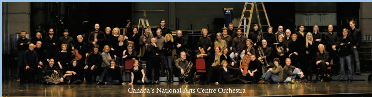
Canada's National Arts Centre Orchestra

(Training and Showcasing of Young and Emerging Talent continued on next page)