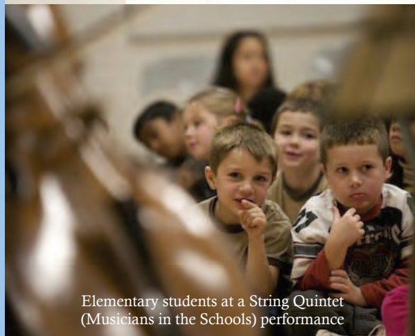
Elementary students at a String Quintet (Musicians in the Schools) performance