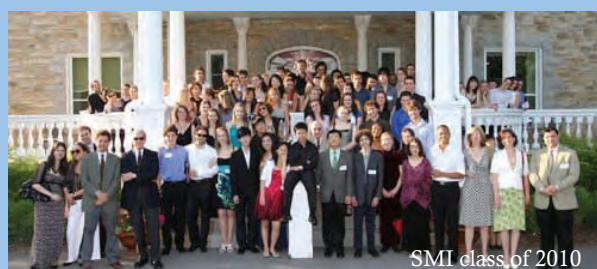
SMI class of 2010

Young Artists Program participant from South Korea