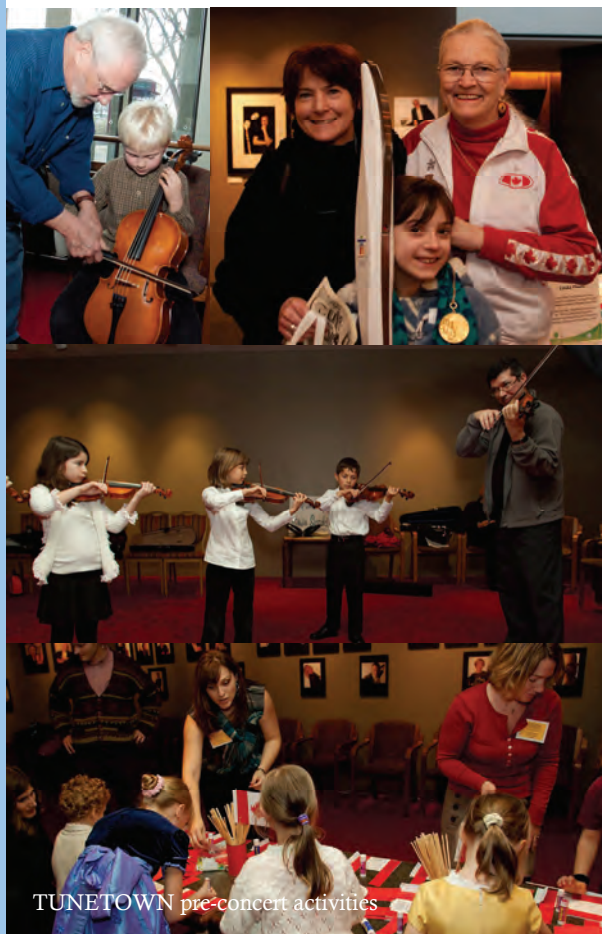
TUNETOWN pre-concert activities

TUNETOWN , supported by The Friends of the NAC Orchestra, sets the mood for the TD Family Adventures with the NAC Orchestra concerts and provides the audiences with an added educational experience. During the 2009-2010 season, the Friends of the NAC Orchestra TUNETOWN committee worked hard to provide over 40 thematically linked activity stations. Community partners included: Canterbury High School; Chuckle Bros.; CTV News Ottawa; Kanata Rhythmic Gymnastics Club; Music for Young Children; Ottawa Children's Concert Choir; Ottawa Folklore Centre; Ottawa Food Bank; Ottawa International Children's Festival; Ottawa Junior Youth Orchestra; Ottawa Public Library; Ottawa Regional Youth Choir; Ottawa Rhythmic Gymnastics Club; Ottawa Suzuki Strings; Suzart; The Ottawa 67's; The School of Dance; Sportball; Sport Canada; and choir from École secondaire publique De La Salle.