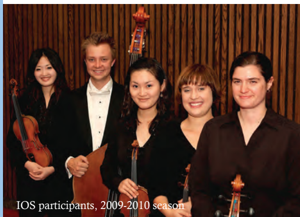
IOS participants, 2009-2010 season