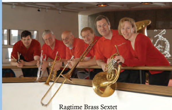
Ragtime Brass Sextet

A total of 36 Musicians in the Schools performances took place, including 11 that were offered free to schools designated as being from lower-income areas of Ottawa, including three performances that took place during NAC Orchestra Week. Funding for the free performances was provided through an anonymous donor. Each ensemble performance was funded in part by The Friends of the National Arts Centre Orchestra and Great West Life.