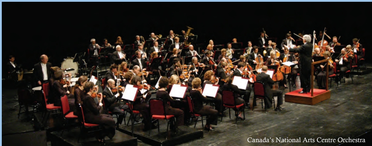
Canada's National Arts Centre Orchestra