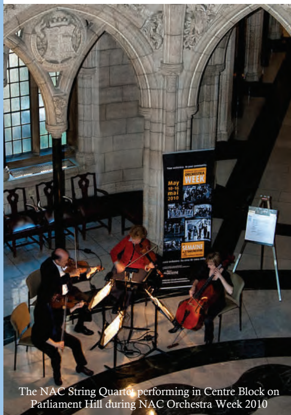
The NAC String Quartet performing in Centre Block on Parliament Hill during NAC Orchestra Week 2010

Notable events during NAC Orchestra Week included high-profile concerts performed in the Centre Block of Parliament Hill, at Ottawa City Hall, and in various schools, community centres, and retirement homes in Ottawa. Other noteworthy performances included a 'Music for a Sunday Afternoon' concert at the National Gallery of Canada as well as several events at the NAC itself, including a student open rehearsal, the NAC Orchestra Bursary Competition Finals, and three CTV Pops Series concerts.